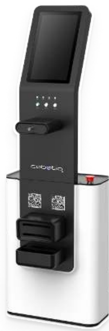
Scrubber 50 Workstation