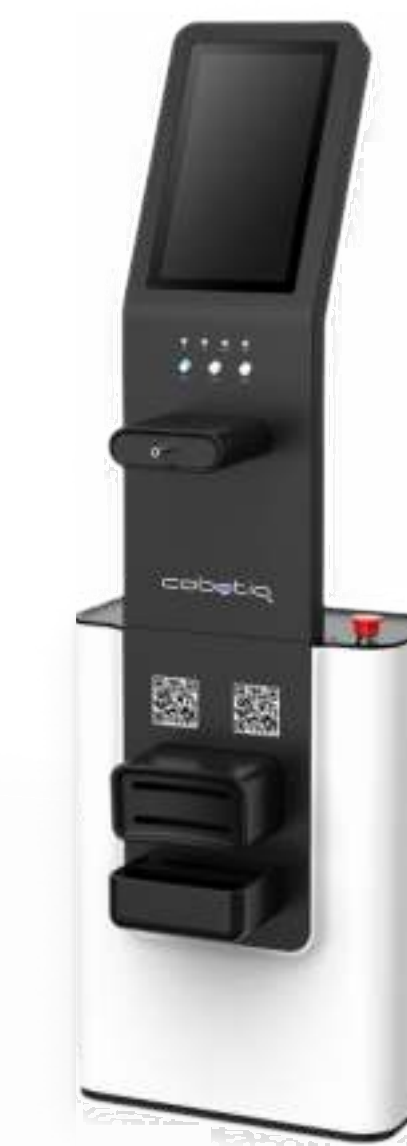
Scrubber 50 Workstation