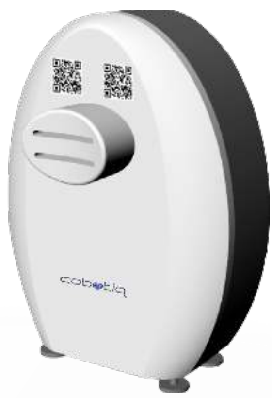
Vacuum 40 Charging Station